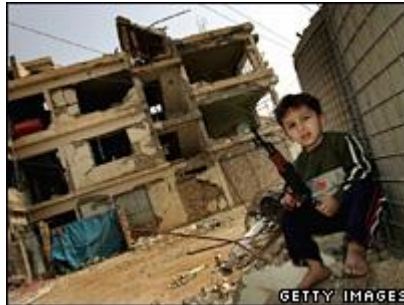
Jalal Talabani said Iraqis still faced huge difficulties five years on

"The walk on this new path began five years ago but it faces huge