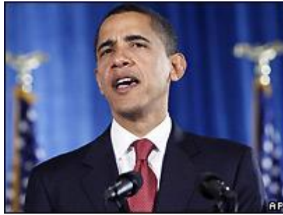
Senator Obama voted against the invasion in 2002

Both he and his rival for the Democratic nomination, Hillary Clinton, have pledged to end the war.