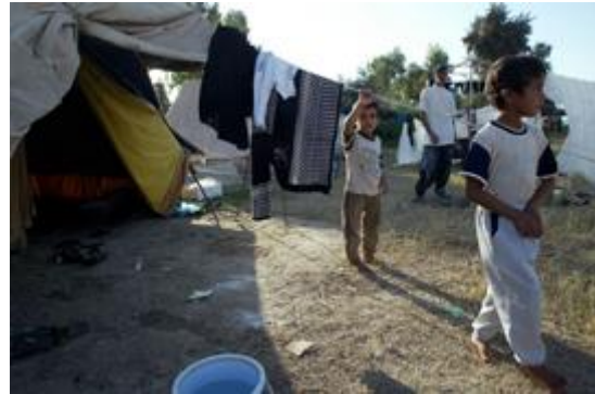
More than two million Iraqis have fled the country since the 2003 invasion

Last year the US embassy in Baghdad documented a high level of corruption at all levels of government, and questioned the willingness of Nuri al- Maliki, the Iraqi prime minister, to crack down on crooked practices.