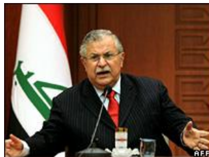
Mr Talabani hailed the US-led overthrow of Saddam Hussein

Firstly, the Iraqi security forces reached a "critical mass" in their numbers, preparedness and equipment levels, with the ministries of defence and interior now in command more than 600,000 personnel, he said.