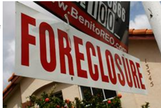
Thousands have lost their homes in the US subprime mortgage crisis