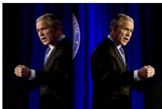
Bush asserted his view that the war in Iraq is necessary and worthwhile

"The gains we've made are fragile and irreversible, but on this anniversary, the American people should know that since the surge began, the level of violence is significantly down, civilian deaths are down, sectarian killings are down," Bush said.