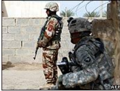
Thousands of residents and soldiers have been killed in the conflict

The party's foreign affairs spokesman, Ed Davey, has called on Gordon Brown and David Cameron to apologise for voting in favour of the invasion.