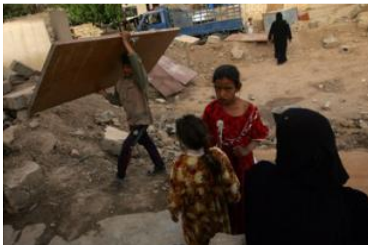
Iraqi civilians have struggled to lead normal lives amid the continuing conflict

Iraq's presidential council on Wednesday signed off a measure which clears the way for a new provincial vote to be held by October 1.