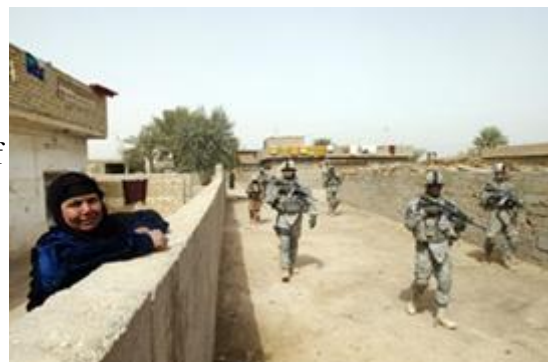
US commanders say that a 'surge' of US troops has contributed to Iraqi security