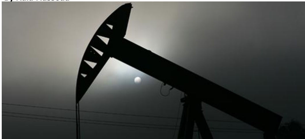
Oil prices have rocketed since the US invasion of Iraq

Five years since the the US began its invasion of Iraq, the world's largest economy is struggling to cope with the cost - estimated to be at least $500 billion and rising.